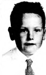
Lordy, Lordy. Guess who's forty? We'll lay it on the line.