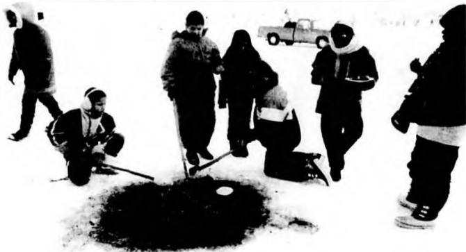
Festival du Voyageur Days at Powerview School were celebrated with bannock baking, jam pot curling, kick the bag on a rope, and dog sled races.