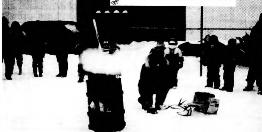
First Fort Maurepas Cub Scouts launched rockets they built at the Lions Carnival. Four...three...two...one...blast off!