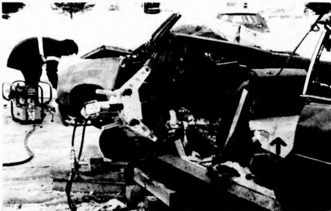
The Pine Falls Ambulance Crew tore apart this car with the Jaws of Life at the Lions Carnival. The Lions donated $7,000 towards their purchase.