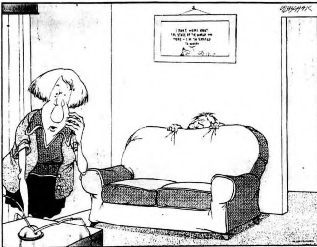
"Here goes — I'm turning on the news!"