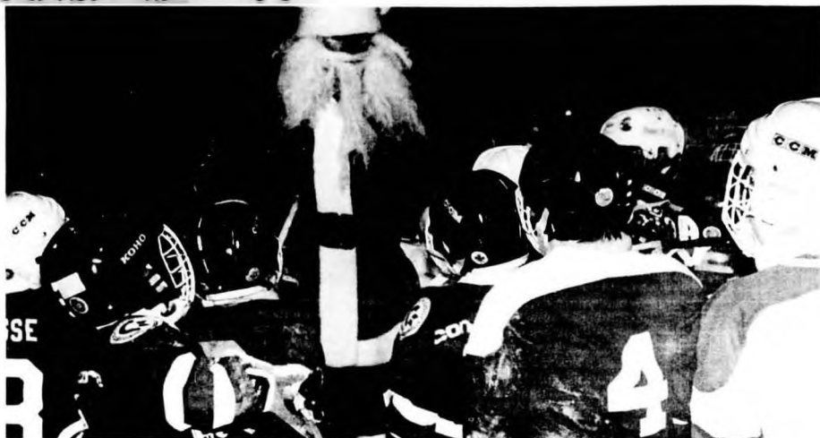
Santa Claus took skating practise with the Pineview Squirrels this past Tuesday before handing out treats to young hockey players.

Our apologies for any confusion this error may have caused.