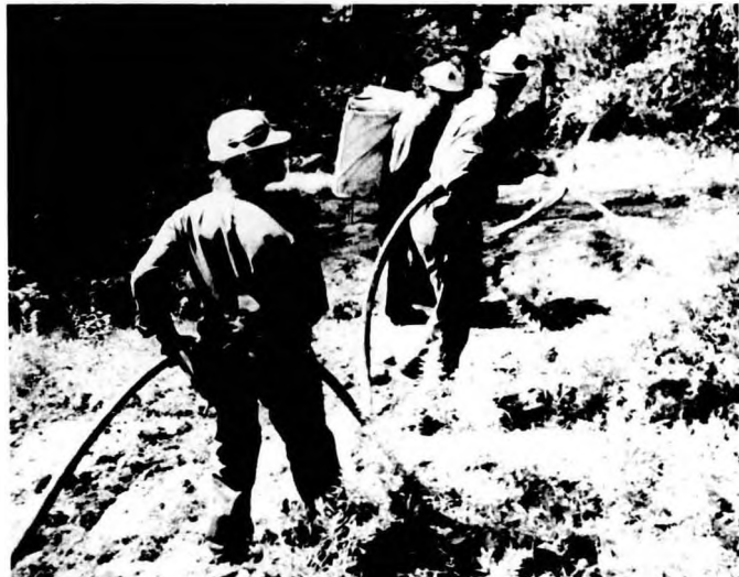
Fire tac crews lay down long lines of fire hoses in minutes reaching from the water source to the fire line. Hours of training speed hose changes.