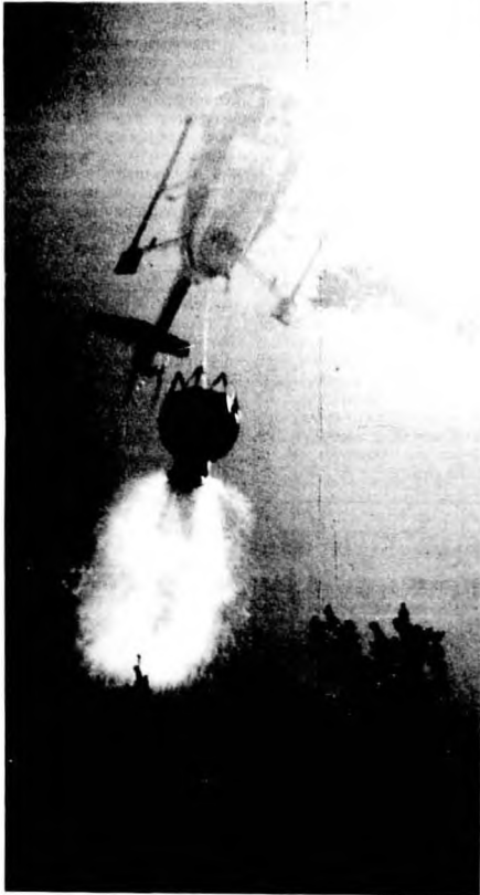
Helicopters drop large buckets of water on forest fires with incredible accuracy.

However, few people are aware of the detailed information which is compiled to make up those alerts.