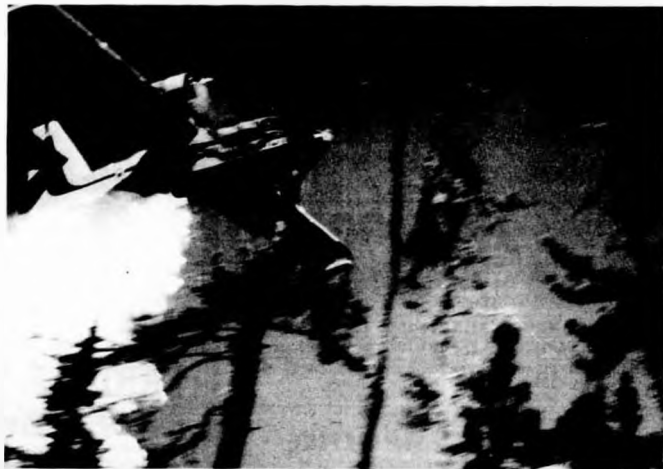
Water bombers dive low to lay down gallons of water. Fire crews direct their line of attack.

Natural Resources provides free literature, fridge magnets with toll free report forest