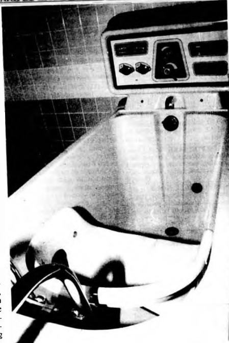
An automatic bath lift has enabled some of the nurses' back-breaking work to be performed safely and cleanly by machine.

The cook, then Lorna French (Jack) not only canned, baked bread, made jams and jellies — she was on call and was expected to man the office if the nurse