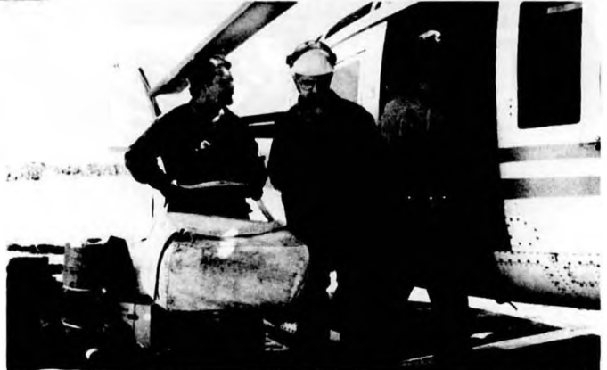
Natural Resources fire fighters carefully load the helicopter so that equipment can be removed in the order to be used. Careful planning makes the work easier.