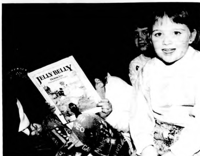
Excited children wait for the start of the Prairie Theatre Exchange's performance of Jelly Belly .

adult who has learned to write poetry which relates to children.