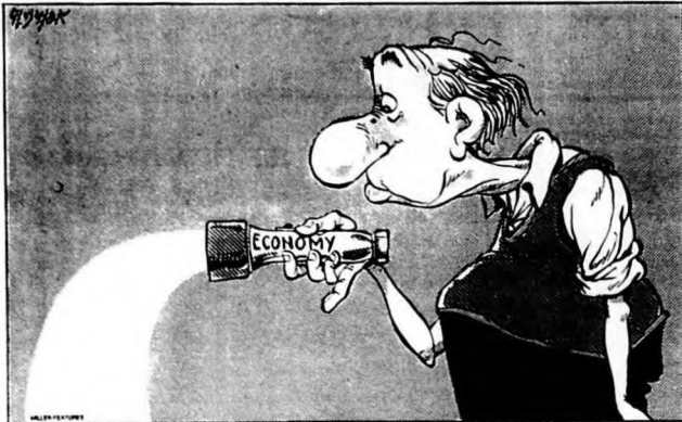
LIGHT AT THE END OF THE TUNNEL!