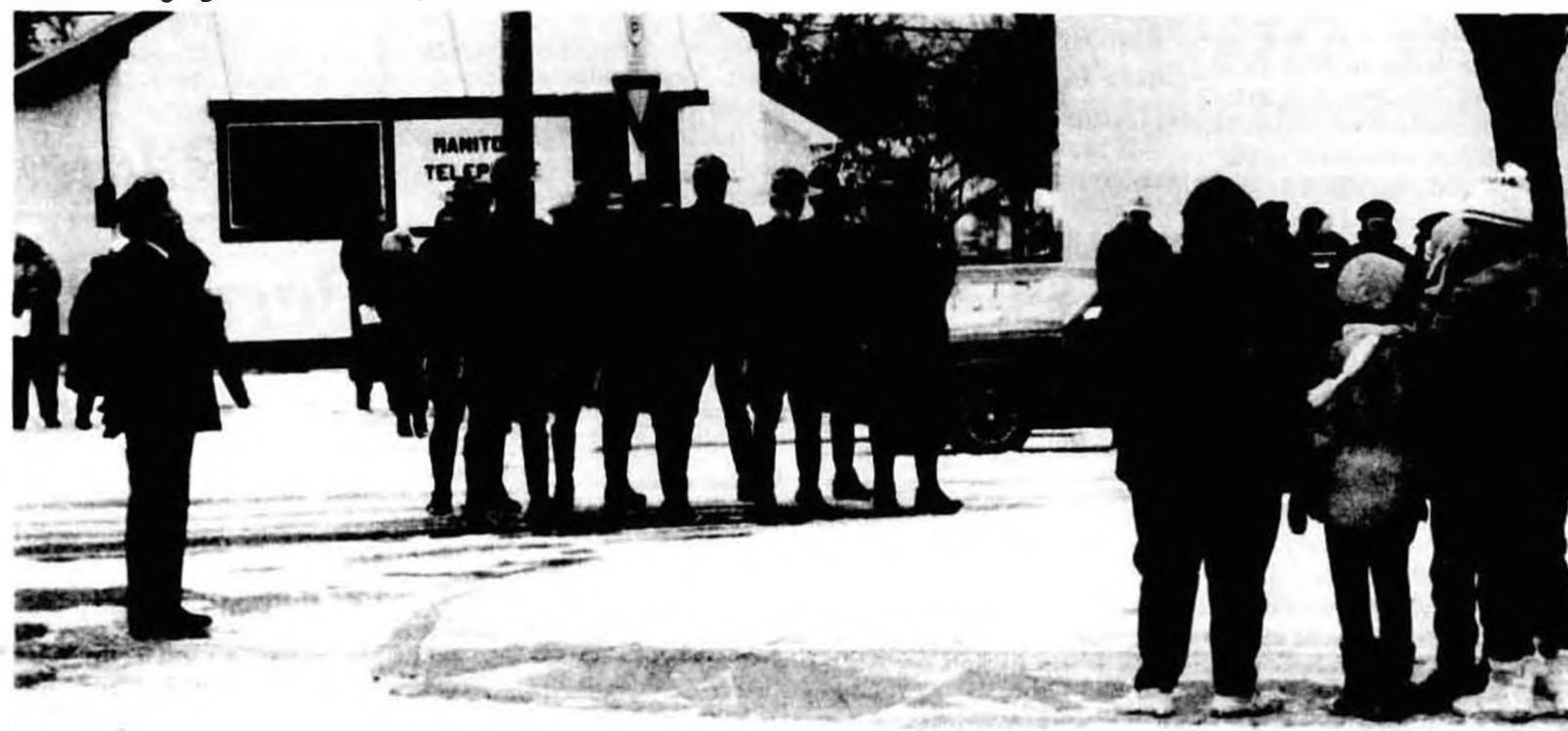
Royal Canadian Legion comrades, a contingent of RCMP and the public pause in the chilly air to remember those who gave their lives for our freedom.

The service was followed by the traditional hot tomato soup and refreshments in the Legion Hall.