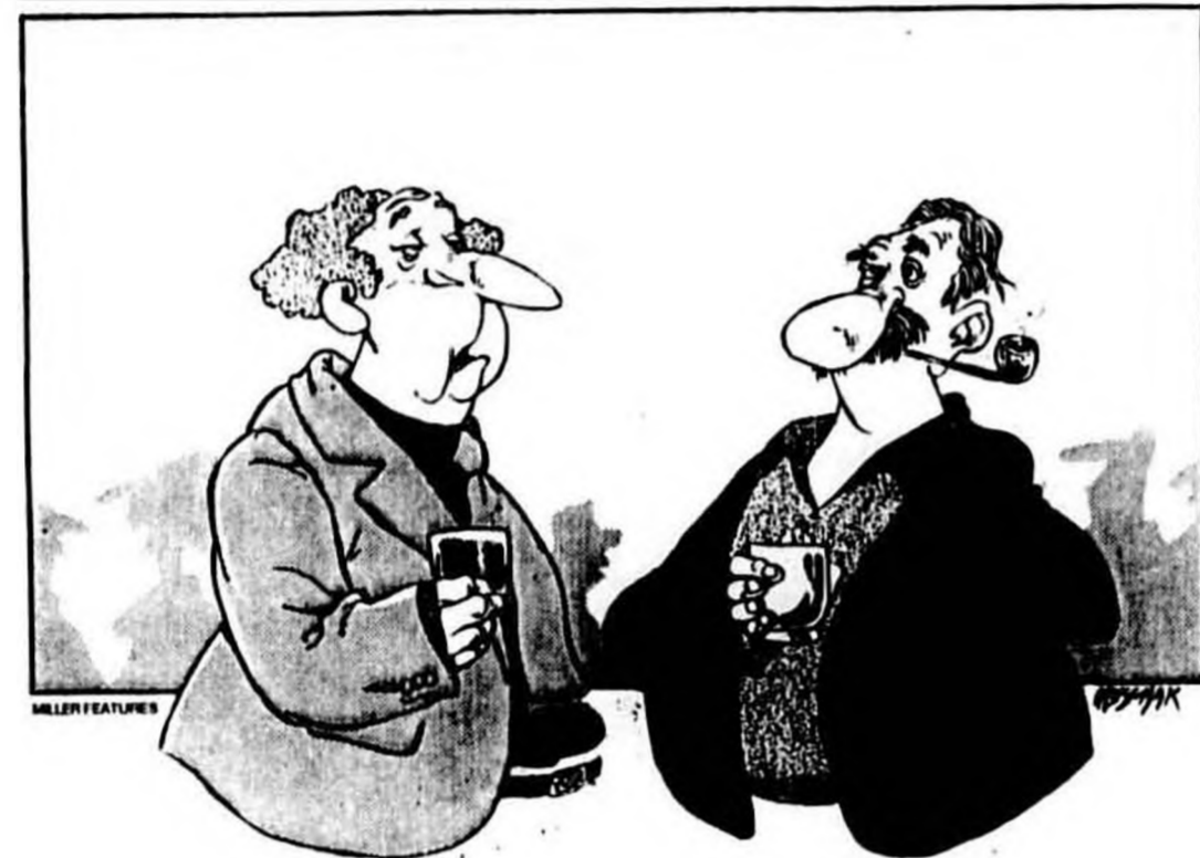
"CANADA SHOULD SEND THREE MORE DESTROYERS TO DESTABILIZE IRAQ'S ECONOMY—MULRONEY, WILSON, AND THE BANK OF CANADA GOVERNOR!"