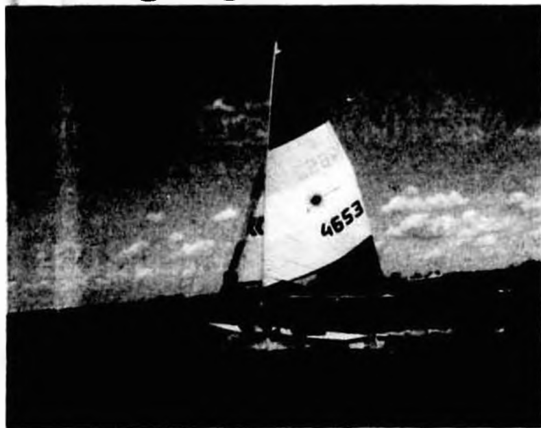
The fun part about sailing.