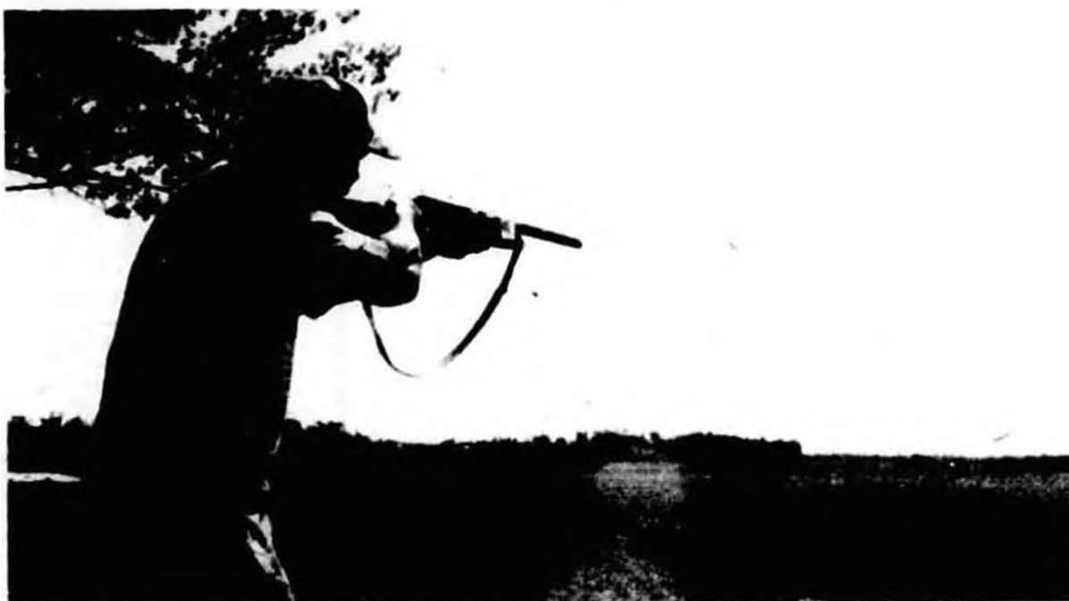
Shooter takes aim at clay pigeon on the sporting clay course near Broadlands Road.

round, weather permitting. The recent rains cause no problems for participants. "Just remember to wear your rubber boots," Guy Bruneau says.