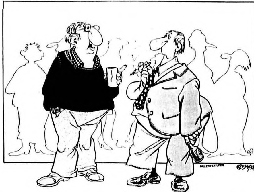
THE TORIES ARE A VERY RESPONSIBLE GOVERNMENT—RESPONSIBLE FOR THE BACK-BREAKING TAXES, LAYOFFS, OBSCENE INTEREST RATES, ALIENATION...