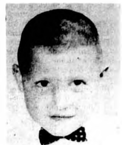
Thirty-one years old are you, your family sends best wishes to you. We are so glad hunting season is thru. But darn, the water is frozen too!! Love from All your girls