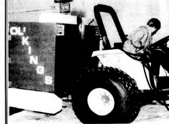
The work included repair of some hole damage, complete paint job to match the new tractor, and attaching decals of the four major financiers of the new tractor — Abitibi-Price, Lions Club, O' Kings and Pepsil.

A big thank you to Chic Desautels and Powerview Falls Autobody for the donation of time and materials to "spruce up" the old ice machine.