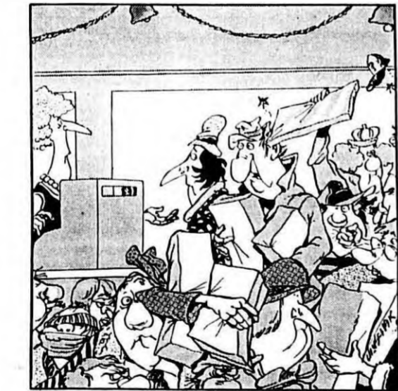
"Amazing how Christmas seems to come around when the stores are busiest!"

I will miss you, and I hope to visit you my first opportunity.