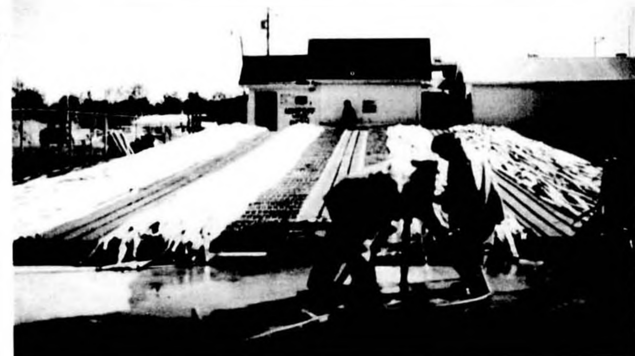
At the Pine Falls Natural Resources warehouse, crews work around the clock to wash, dry, patch, splice and box fire hoses for the Eastman Region, as well as the Whiteshell and Interlake regions during peak fire activity weeks. Since the facility opened in the fall of 1986, 12,000 hoses have been processed.

Find it all at page 192 Manitoba Yellow Pages™