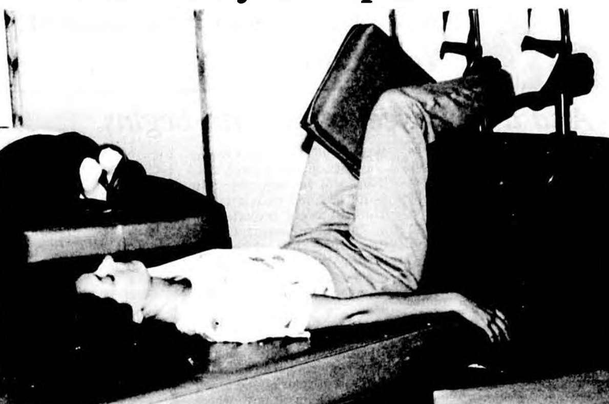
The feet are strapped into the foot rests that rotate to provide a mechanical workout on the leg table, one of seven muscle toning tables at the newly opened Body Sculptures.

After speaking with a full room of satisfied customers one Tuesday evening, they say,