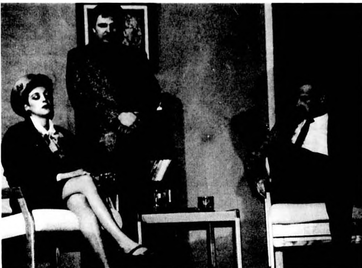
A scene from Boeing-Boeing

Congratulations to the Pine Falls Drama Club, whose talent and hard work was most appreciated.