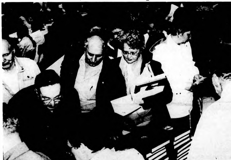
It was standing room only in the Legion Hall on the evening of the historical book launching. The red leather hard covered