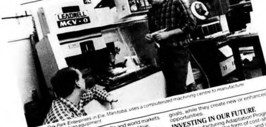
Qui Park Enterprises in Elm, Manitoba, uses a computerized machining centre to manufacture woodworking equipment.

As the economy shifts and world markets become increasingly competitive, Manitoba's manufacturers are looking for new ways to upgrade existing plants, to develop new manufacturing capabilities, and to adapt existing technology to meet world market demands. The Manitoba Jobs Fund's Manufacturing Adaptation Program has been established to help Manitoba business and industry gain that competitive edge.