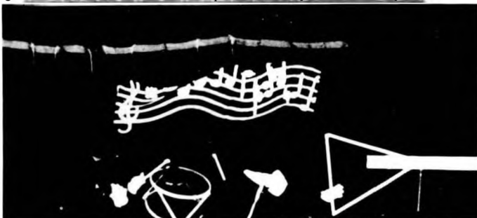
The finale of the Pine Falls Drama Club's production "Hands Up" featured instruments playing a Christmas carol. A drum and a mandolin are visible with a foot dancing in the centre. A few bars of sheet music danced around the stage. All objects appeared alive as cast members, who maneuvered the articles, were dressed in black and were invisible on the blackened stage.