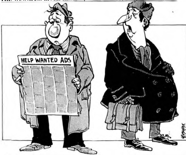
"HOW WAS YOUR CHRISTMAS OFFICE PARTY LAST NIGHT?"