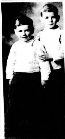
Happy Birthday Boys! on October 16 and November 11.

MacKay has certainly got her hands full at the moment, but she is eager and very optimistic about the future. Perhaps she is the silver lining around the black cloud that seems to be hanging over the new hospital these days.