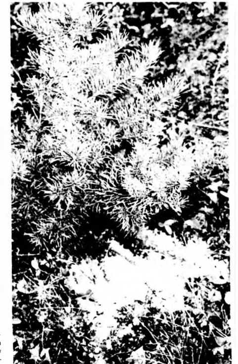
Velpar, a slow release chemical for hardwood control in reforestation projects has left the patches on which it was sprayed clear of growth for up to four years. Controversy over the use of the chemical responsible for the bare patch in the foreground has resulted in its not being used in Manitoba.

He did say that the market for hardwoods is changing, but it has not reached the point where all the hardwoods growing in the provincial forest can be used. When asked how they could make those decisions based on a 60 year turn around for the forest product, he went back to his earlier claim that the department is ensuring the resource for the future.