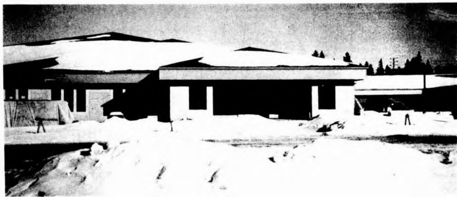
Taken from the parking area at the Pine Falls Hospital, this is the main entrance. We will have more news on the progress, a possible date of relocation of patients, offices and administration, with