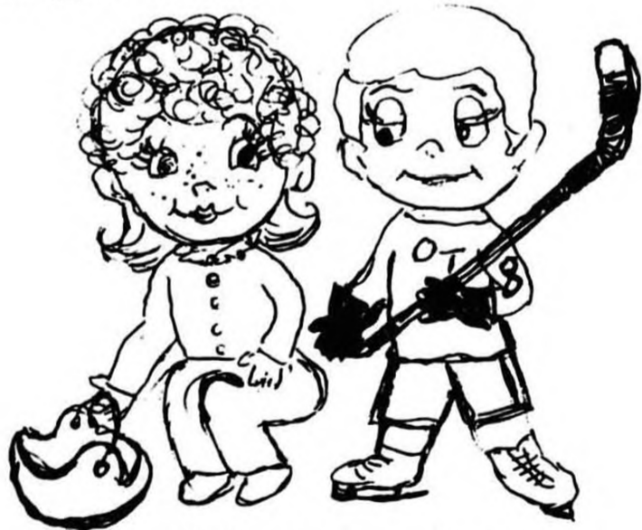
Going to your first "Old Timers" Hockey Game