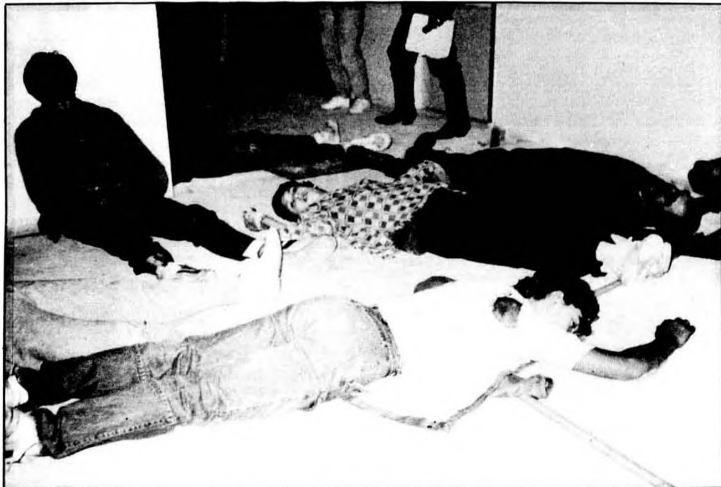
The scene at the Pine Falls Hospital just before the alarm went out. This mock disaster looked very realistic and would be the test for staff of both hospital and ambulance. This area was part of the new addition where the roof was to have caved in.