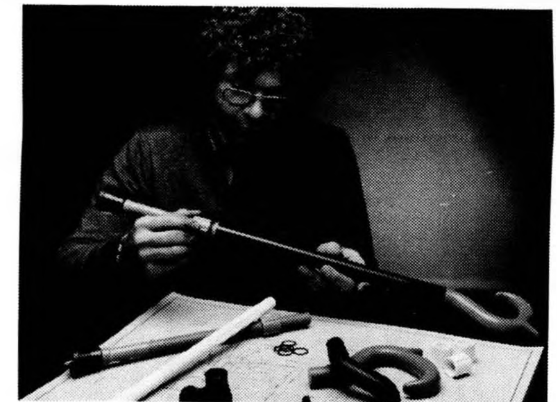
These innovative walking aids, developed in Manitoba by Ambutech, reflect an expertise in the use of modern plastics technology that is recognized world wide.

The Manitoba Jobs Fund is helping to create a broader technological base with initiatives such as the Technology Commercialization Program