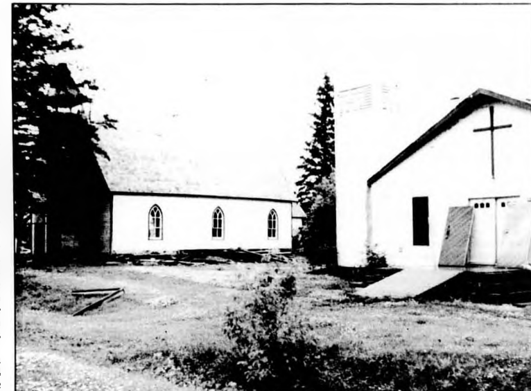
Renovations of the 100 year old Fort Alexander Anglican Church (left) with the intention of resuming regular church services when restoration is completed.