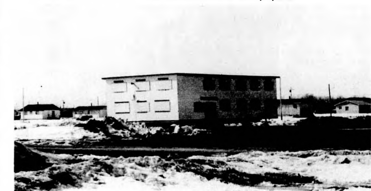
Perched on wooden blocks, the "old" nurses' residence of the Pine Falls Hospital awaits a new future in the Fort Alexander Indian Reserve.

The Courchenes realize the problem of accessing public funding, since the building is now privately owned, but they have good hopes that the band will be supportive of one of their proposals.