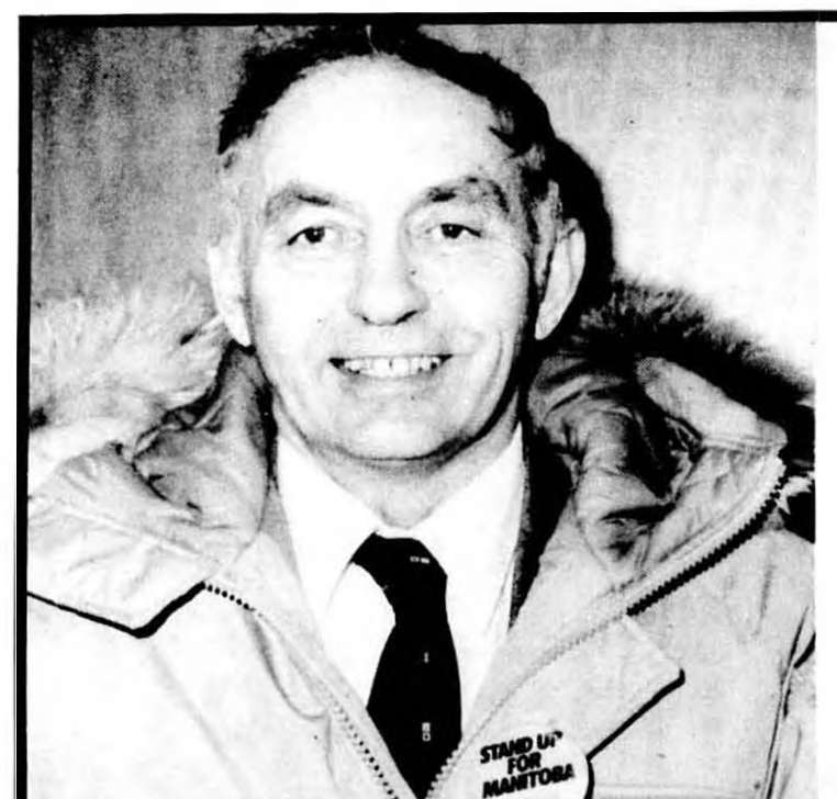
Thank you to the people of Lac du Bonnet riding.