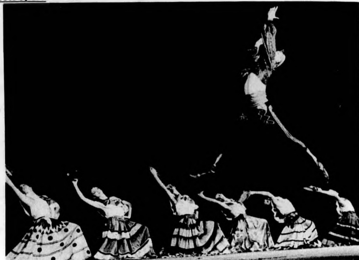
The Yugoslav dance company Frulica

Circle this date on your calendar Wednesday, March 19 . Don't miss it!