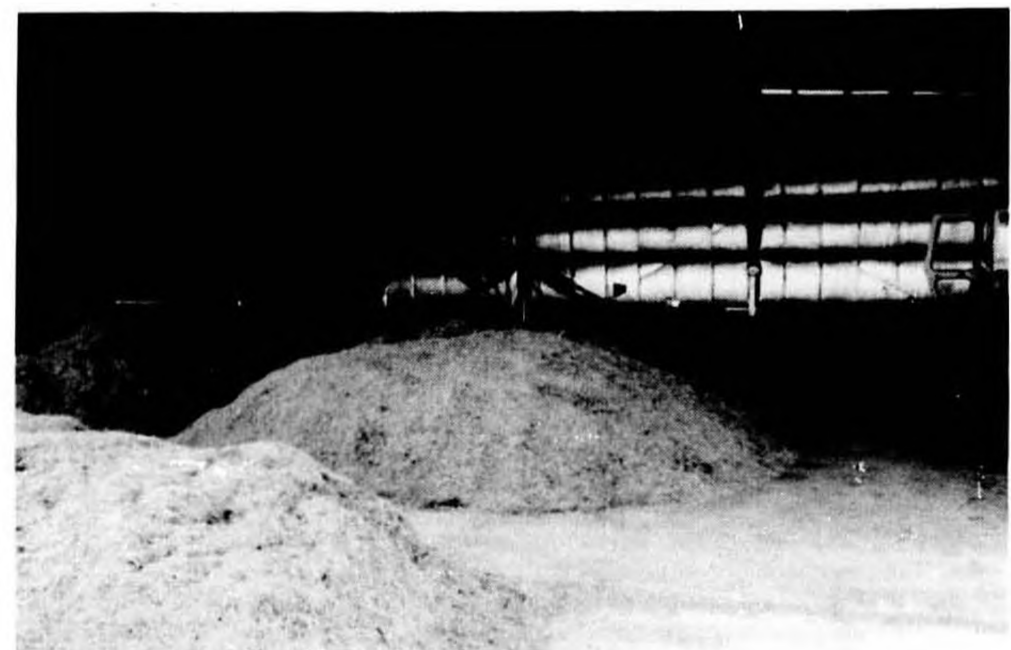
Green rice in heating process in Gaffray's second hangar.