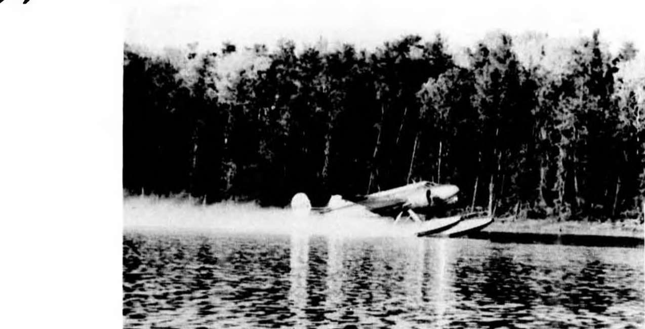
A beechcraft 18 loaded with green rice — ready for take off.

With ingenuity, craftsmanship and a great deal of creativity, the plant grew to its present status. The Gaffray brothers are still continuously working to improve