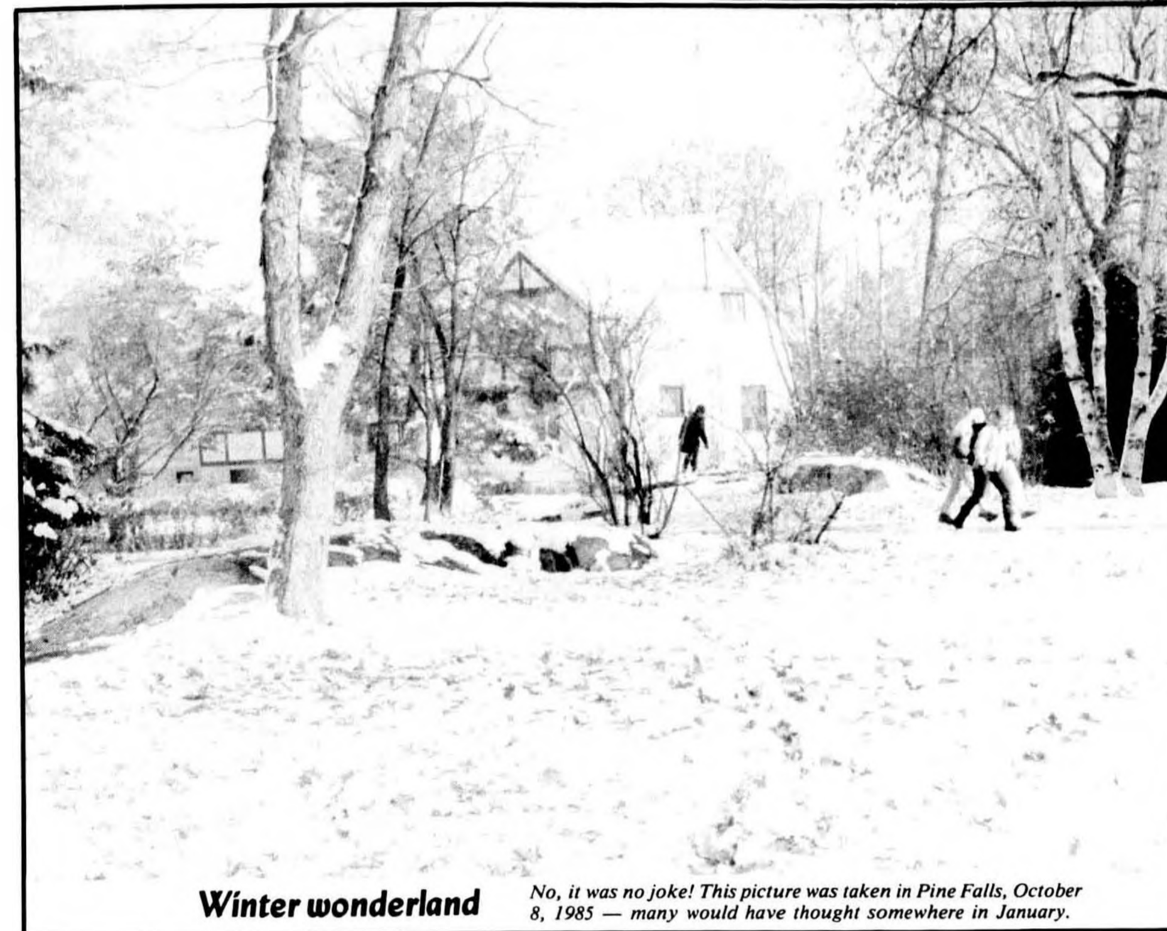
Winter wonderland No, it was no joke! This picture was taken in Pine Falls, October 8, 1985 — many would have thought somewhere in January.