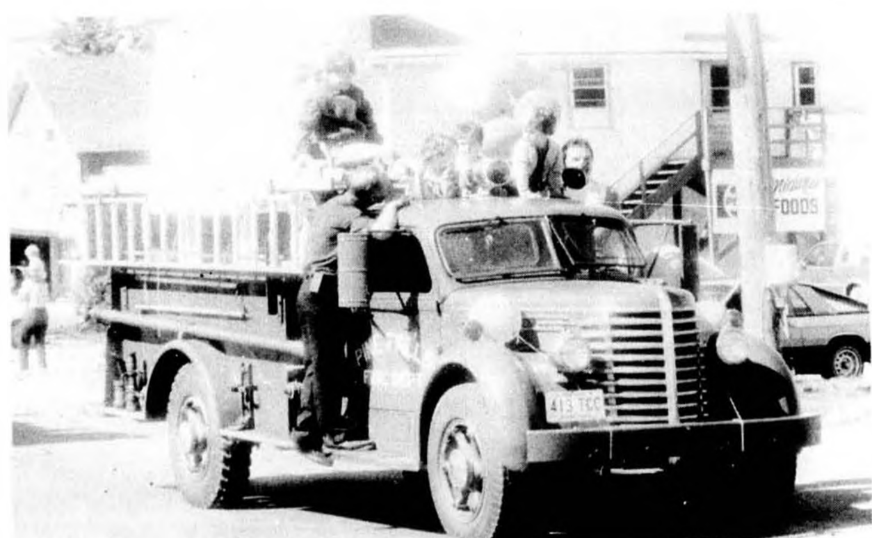
An "oldy" but "goody". Pine Falls Volunteer Fire Department ride firetruck in parade.