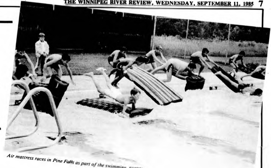
Air mattress races in Pine Falls as part of the swimming events.