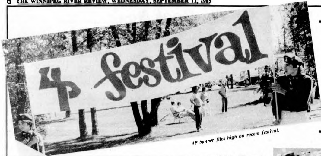
4P banner flies high on recent festival.