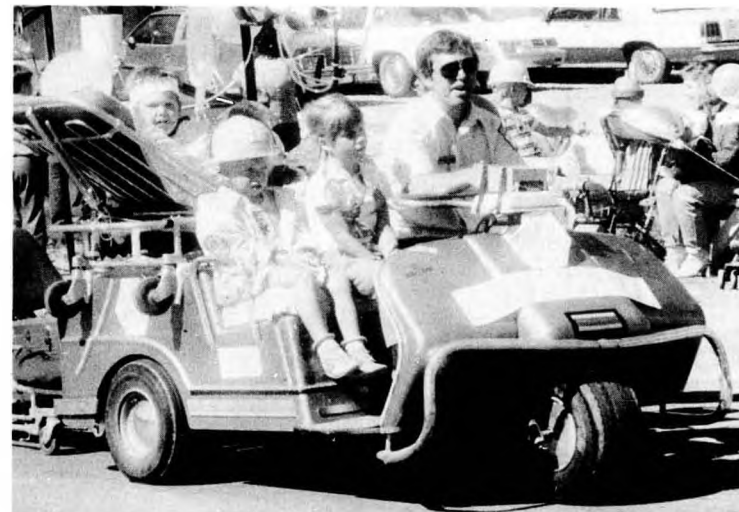
A Pine Falls ambulance delegation driving its parade entry to the "best community" award.