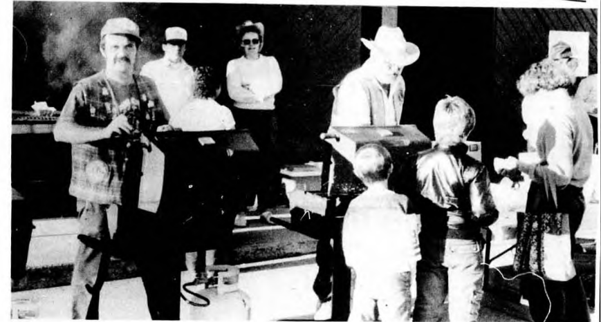
Winnipeg River Lions Club members treat the community to a super barbecue supper.