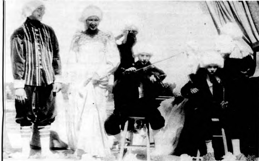
4P parade viewers were taken back to the 18th century by way of the M.R.A.C.'s float titled Amadeus.