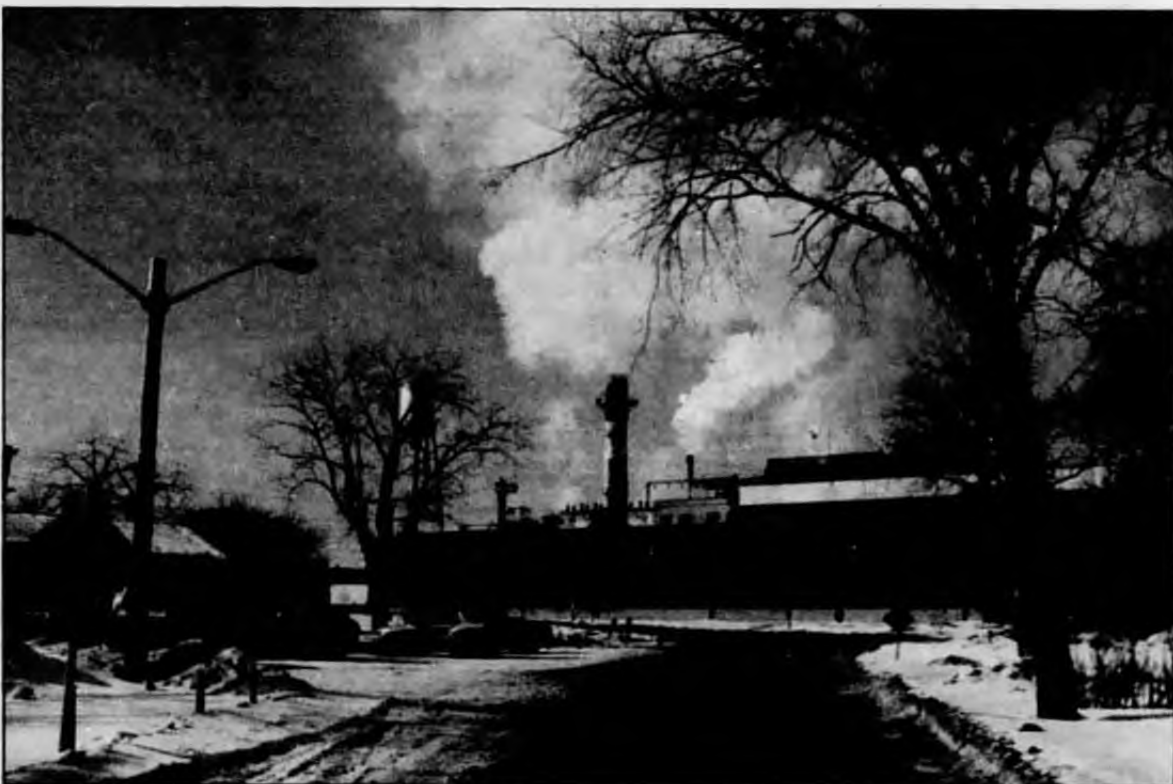
Tembec announced on Tuesday that their Pine Falls Mill is up for sale.