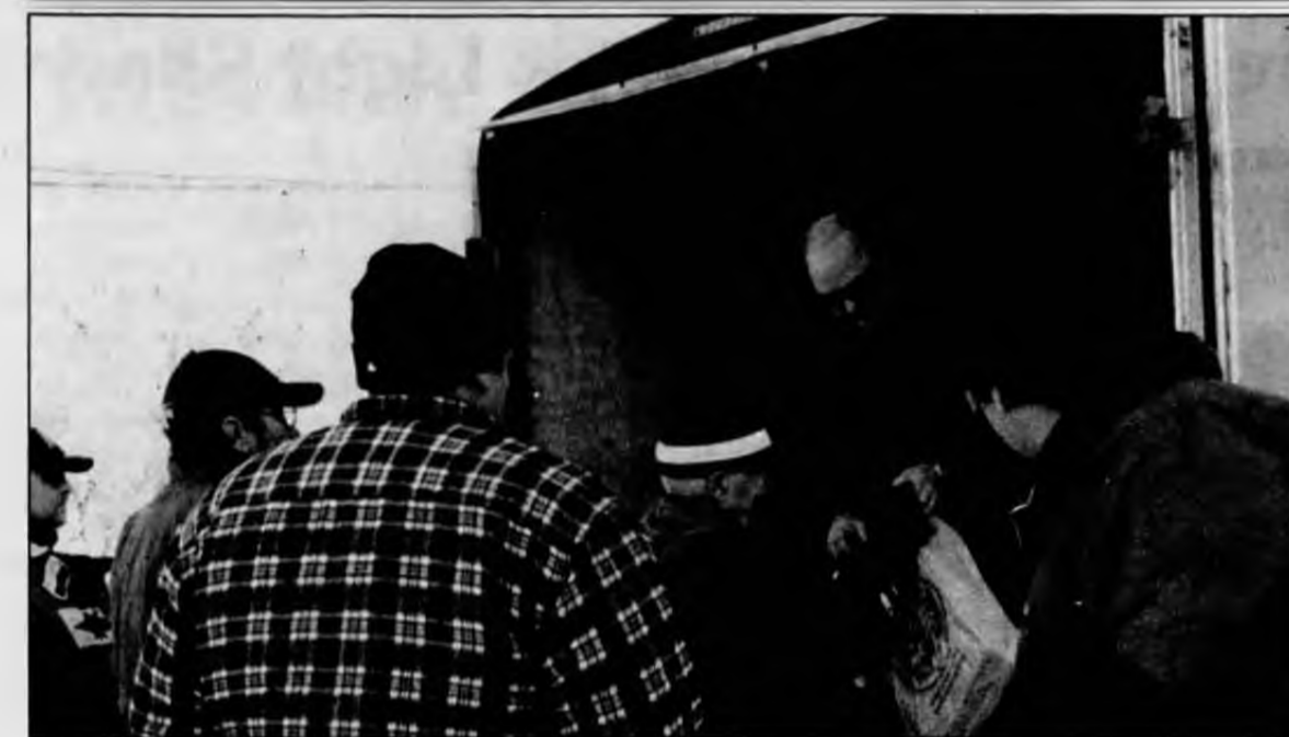
Unloading the truck.