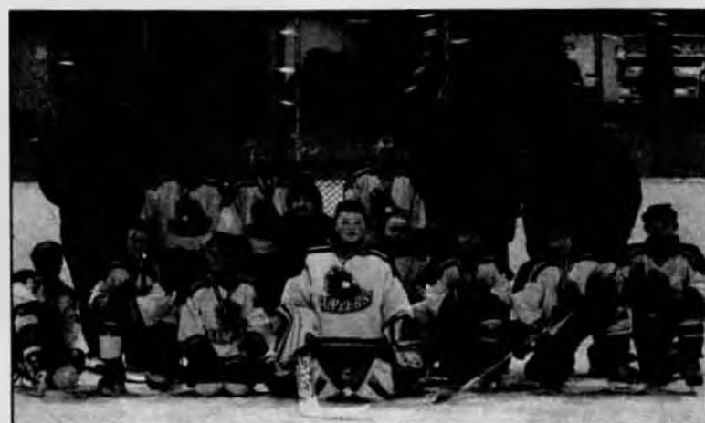
Le Des Chenes