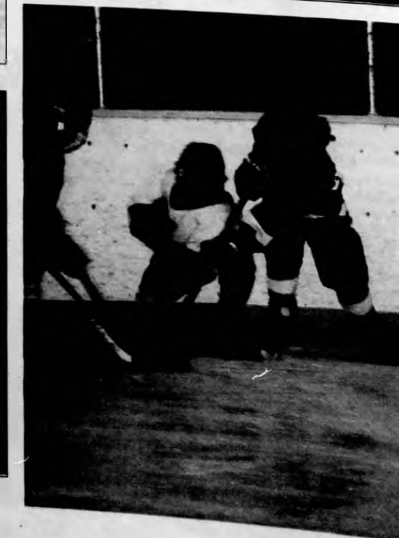
A little action around the net.

Phillips' Massage Therapy Holiday Madness Gift Certificate Sale Thursday Dec 3, 10 & 17 (after 6 pm - until closing) Sunday Dec 20 (noon until 4 pm)