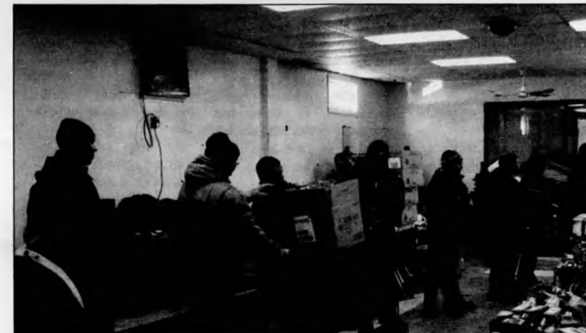
Human chain unloads more than 300 toys into the Union's resource centre in Powerview.