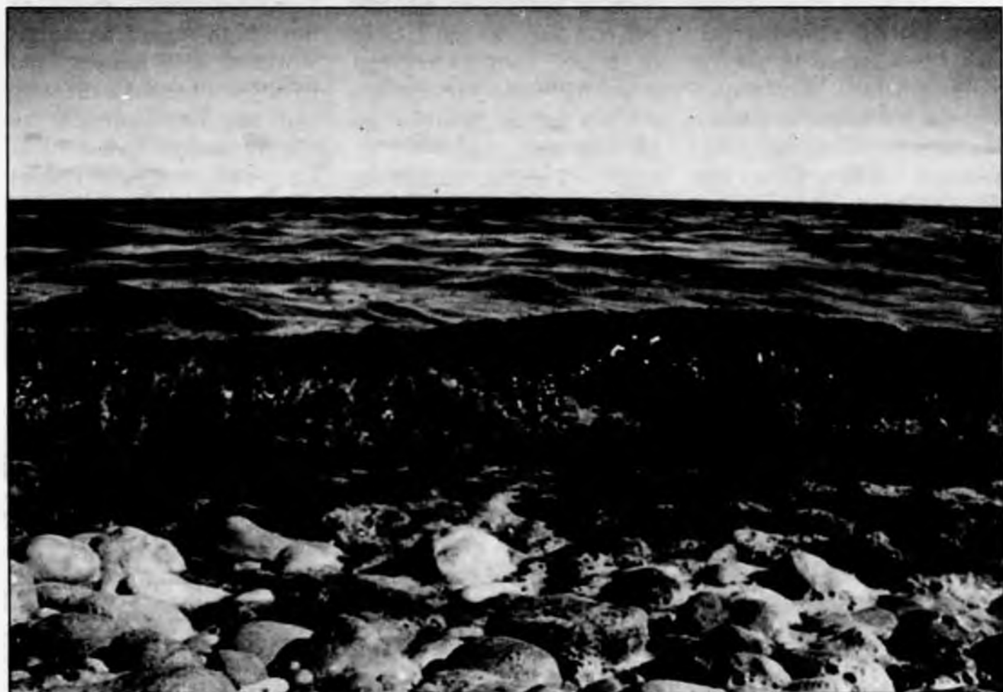
Algae bloom on Lake Winnipeg