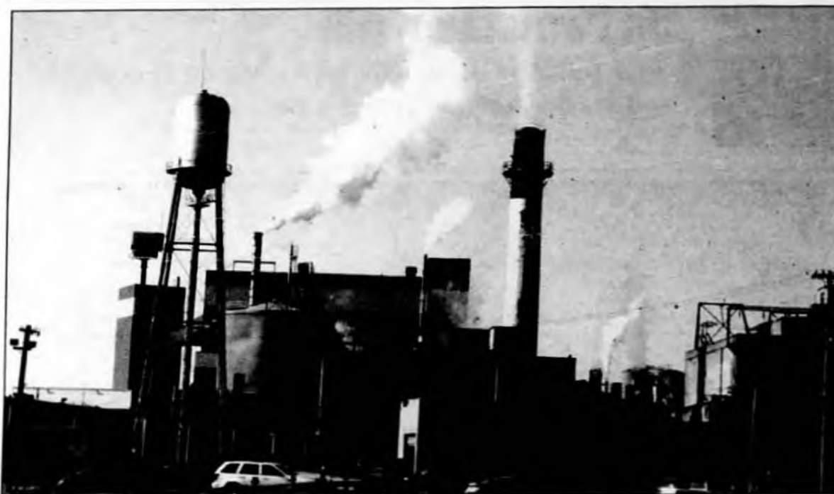
Tembec's Pine Falls Mill