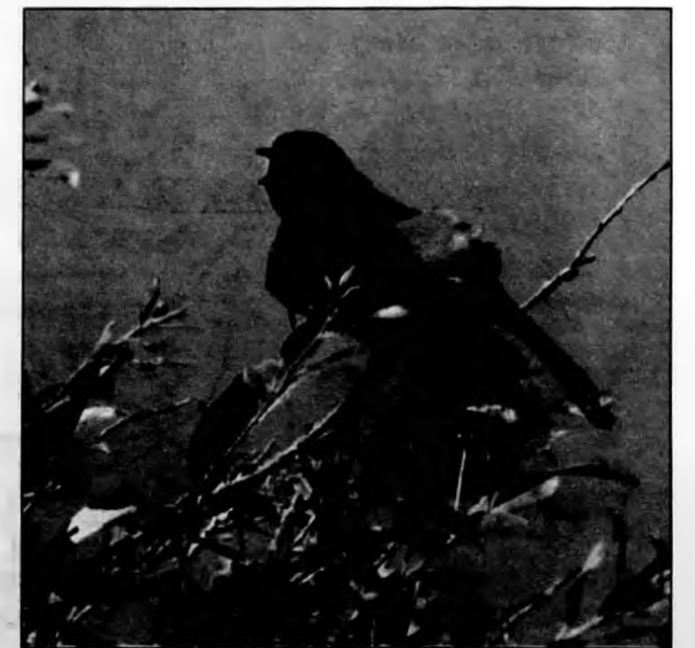
A redwing blackbird singing its heart out above the hillside lagoon

under threat, many others are. There are many, many reasons to protect wetlands and perhaps the recent findings will provide an incentive to protect them all at once instead of a piecemeal one-at-a-time effort.