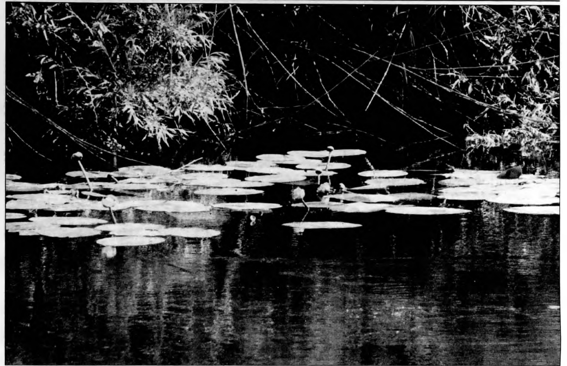
the hillside lagoon alongside the path to the beach directly below the redwing