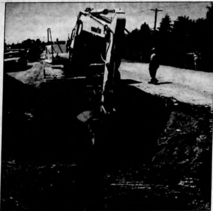
The excavation on Highway 11

A few years ago Dupont road was washed out when the creek managed to flow around instead of through the culvert. That problem was solved by installing a much larger culvert.