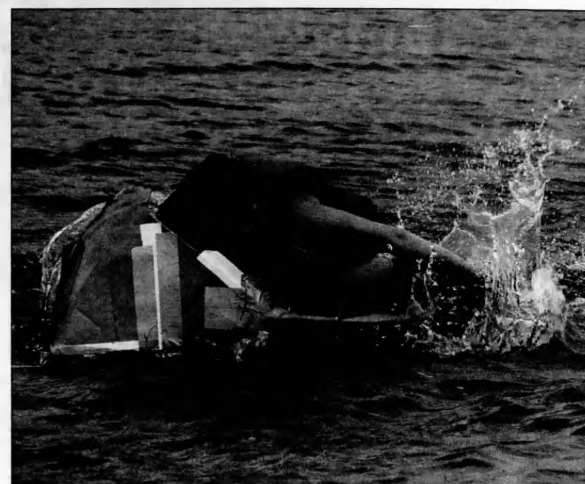
Winner of last year's cardboard boat race

Festival organizers are looking for local musicians to entertain the crowd in the tent Rendez Vous on Friday, July 17, beginning at 7:00p.m. The evening will feature the band "Dog Pound".