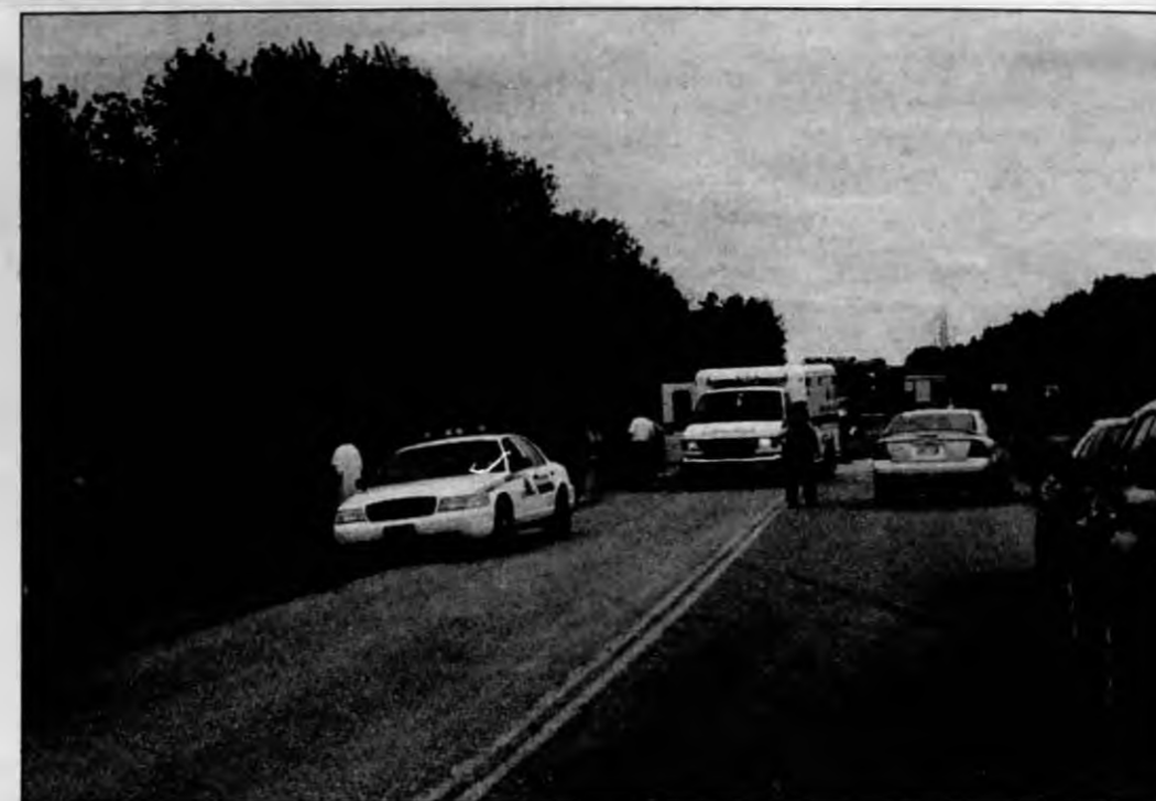
Emergencies vehicles at the scene of a rollover last Tuesday, June 30th

But she noted that within council there is an environment of conflict that is not being addressed. She said the council struggles a bit. "They need to grow, but there is so much on their plate." She said, "There is some growing work to be done. They need to come together as a team."