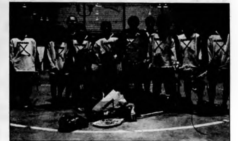
Sagkeeng Bantam Lacrosse Team

The arena in Fort Alexander was a buzz of anxious parents, judicious coaches and really active sportsmen and women for the weekend of July 3 to 5th. With the Papertown Motel and it's fabulous water slide close by; and with the city of Winnipeg just an hour and a bit away,