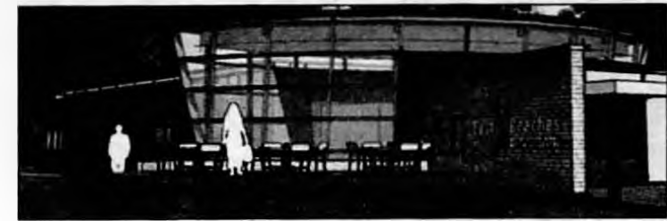
Architects rendering of the facility.