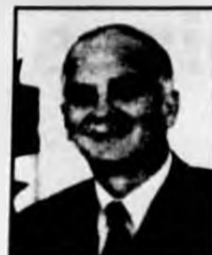
Your voice in Ottawa Vic Toews, MP for Provencher