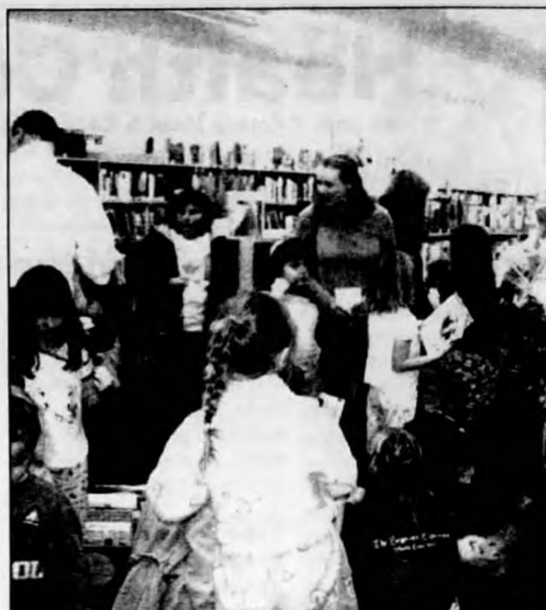
Parents help the kids find their way around the library in a Scavenger Hunt.

If you or your family are interested in any of the listed animals here or others at the shelter, you can call us at 204-982-3551 or Fax 204-982-2047