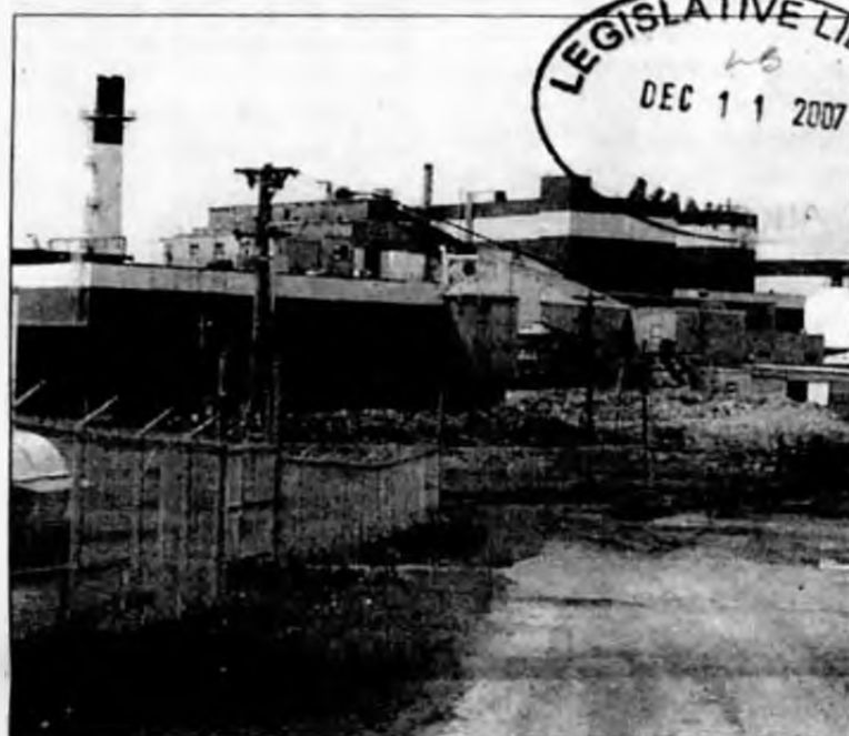
Price Increase good and bad for Pine Falls

There are rumours that the Bank of Canada will reduce