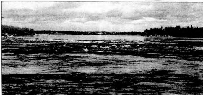
High water level and strong currents along the Winnipeg River add to the debris problem