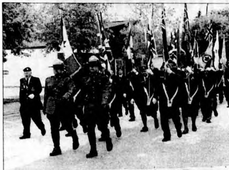
RCMP lead the Lac du Bonnet Legion on parade this past Sunday during the annual Decoration Day ceremonies