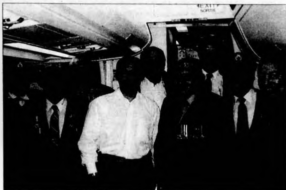
Honourary Veterans and invited guests were joined by the Prime Minister, Paul Martin on board flight CAF 001

We had an early start the next morning as it was June 6 th one of the most important days in modern history. We were escorted to the Juno Beach Centre in Courseulles-sur-Mer for the Canadian National Ceremony of