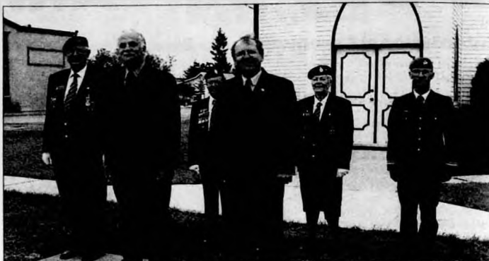
Federal MP Vic Toews (left center) was in Lac du Bonnet over the weekend to salute veterans at the Legion's annual Decoration Day ceremonies

"What we intend to do is take the money spent in the administration of C-68 and put it to work in other areas," he noted. "We need to look at new child laws and expanding the sex offender registry, for instance."