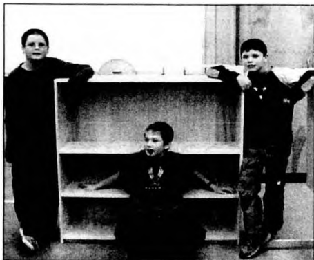
Students constructed a bookshelf that is to be delivered to the Pine Falls Health Complex

So far we have had two Lunch Hour Movie Manias. Movie Mania was played in our multipurpose room at lunch time, as you may have guessed. We played two Halloween movies and asked for a donation of $0.50 or a non-perishable food item. The Movie Mania was very successful. Then on Halloween we created a haunted house. We had students from jr. kindergarten to grades 12! It was very exciting and most of the props were from students in our classroom. In that spooky activity we managed to raise $85.00 and 91 lb. of food! It was quite a turnout and our class was busy all day. We are also making a bookshelf that is to be delivered to the Pine Falls Health Complex. We are filling it full of children's books and our construction committee is making it themselves. We plan to donate it soon. Finally we are in the process of painting the downstairs of the Powerview Arena.