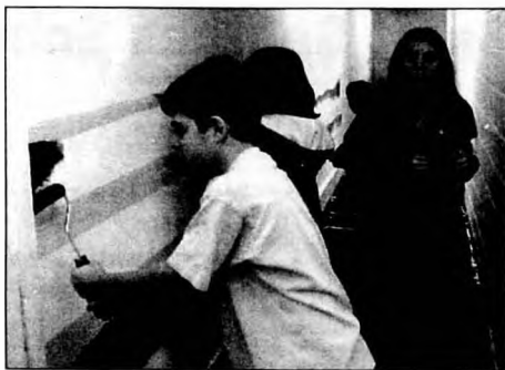
Powerview School students participate in Project K.I.N.D. This part of their project was to help with the Powerview Arena. Students painted the lower level of the arena.

not all bad and that we have the potential to reach goals we've set for ourselves. Project K.I.N.D. started out fairly small, but has grown into an amazing project with fabulous results. This was made possible by encouragement from Powerview School staff and the incredible ideas of the grade 6/7 class.