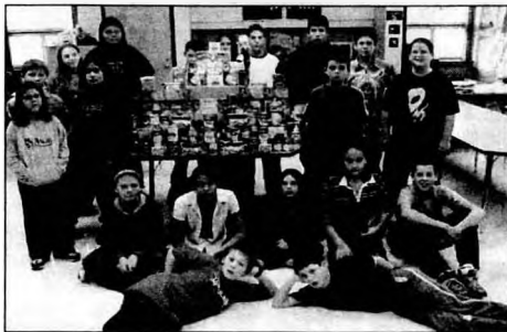
Students of Project K.I.N.D. collected 91 lbs. of food during Lunch Hour Movie Manias and a Haunted House where they asked for non-perishable food items or a donation of $0.50

So far we have had two Lunch Hour Movie Manias. Movie Mania was played in our multipurpose room at lunch time, as you may have guessed. We played two Halloween movies and asked for a donation of $0.50 or a non-perishable food item. The Movie Mania was very successful. Then on Halloween we created a haunted house. We had students from jr. kindergarten to grades 12! It was very exciting and most of the props were from students in our classroom. In that spooky activity we managed to raise $85.00 and 91 lb. of food! It was quite a turnout and our class was busy all day. We are also making a bookshelf that is to be delivered to the Pine Falls Health Complex. We are filling it full of children's books and our construction committee is making it themselves. We plan to donate it soon. Finally we are in the process of painting the downstairs of the Powerview Arena.