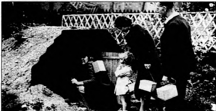
A typical World War II Anderson Air Raid Shelter