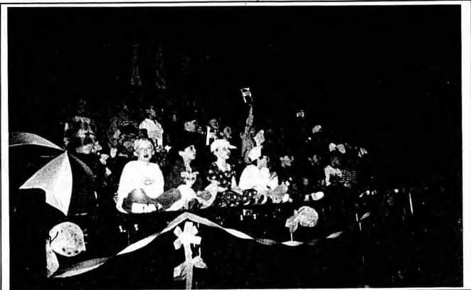
Choir of Grades K to 4 sing their songs