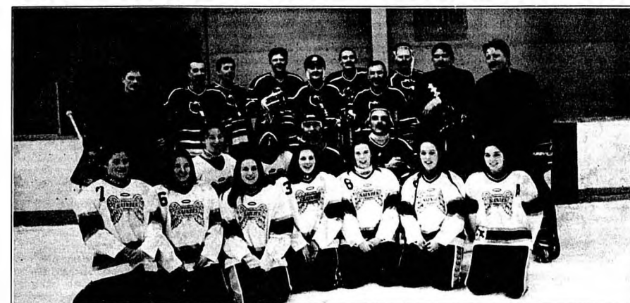
The Pineview Belles with the Powerview RCMP at a law enforcement fundraiser on March 16.