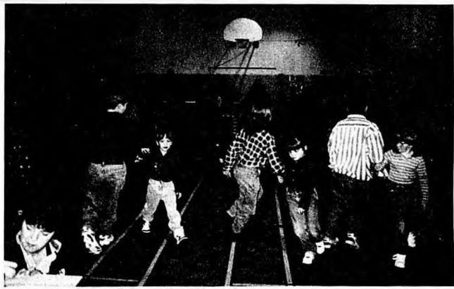
Kindergarten and Grade 3 students from Powerview School do the 'Virginia Reel' at the Powerview School Spring Tea on April 25. The theme of the event was 'Heritage Days'. See story page 4.