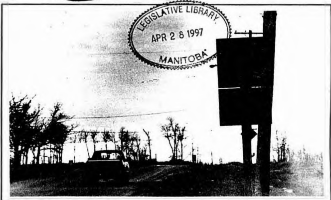
The LaVerendrye Trail sign on Highway 11, between Pine Falls and Powerview