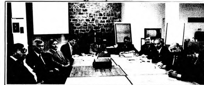
First board meeting of the Pine Falls Paper Company, 1994.

the mill and the town on their anniversary