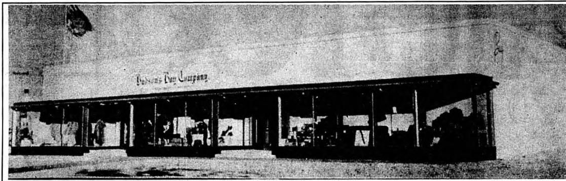
Brand new Hudson's Bay Store, the same place the Northern store is now.