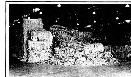
The warehouse full of recycled newsprint on its way to the new de-inking plant completed in 1995

The work that went into the 70 years the Pine Falls Mill has been operational is evident wherever one looks