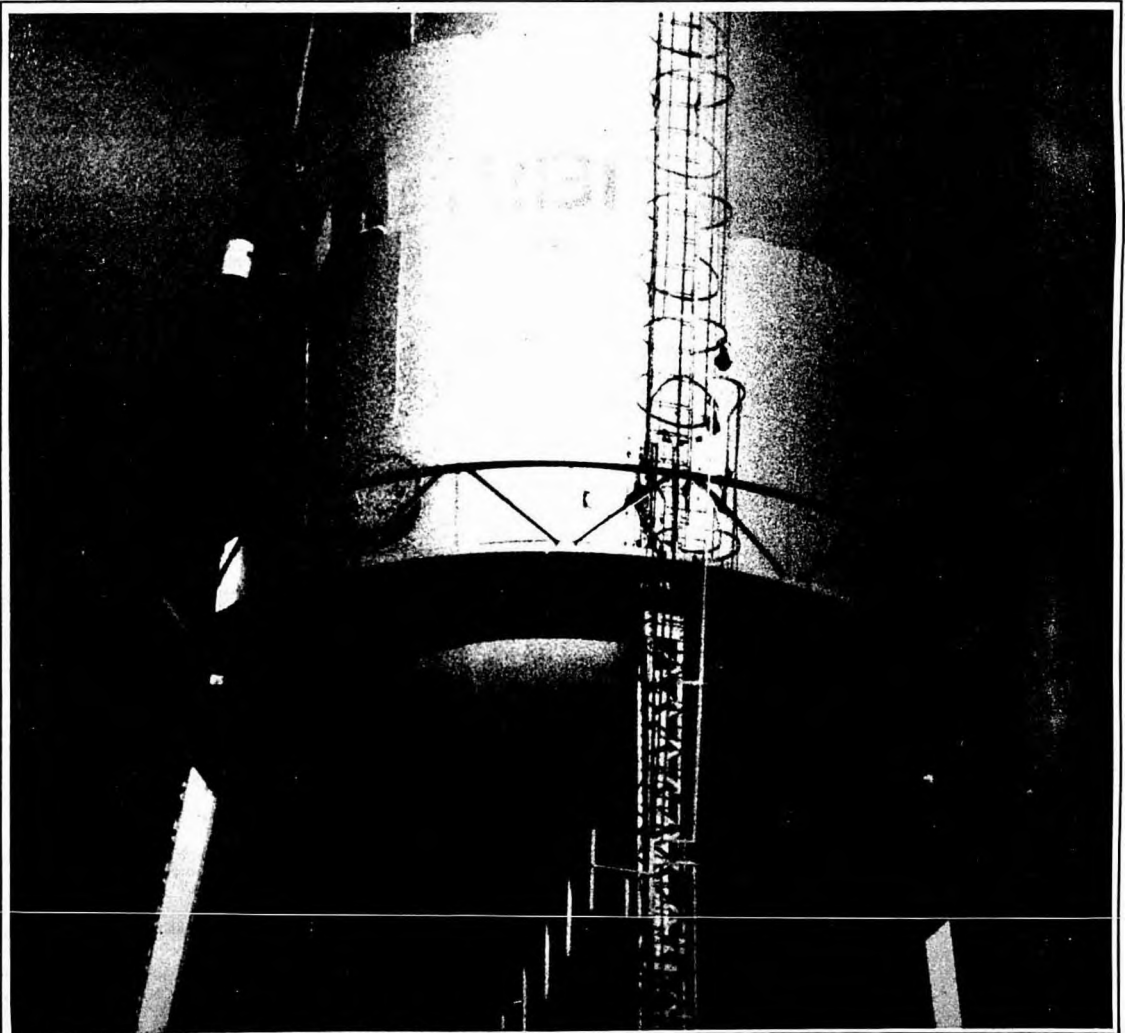
Painting over the Abitibi logo on the water tower at the mill - The Voice - October, 1994