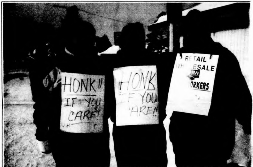
Dressed for the cold, these picketers seem to be taking things in stride. There was a strong feeling of solidarity on the picket line Monday.

The picketers were handing out photocopied letters apologizing to residents of Pine Falls and the surrounding areas for any inconvenience caused by the strike, and to ask for a show of support by not shopping at Northern Store. Community support seemed to be in no short supply. Honks of approval could be heard from the Voice office all day.