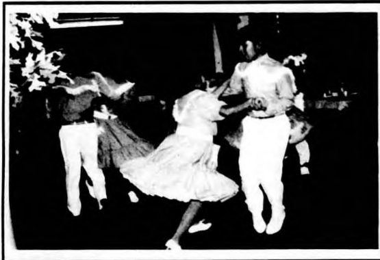
High Steppers, a square dance troupe from Hollow Water First Nation.

The Waasaabiyaa Shining Waters Heritage Region held on Friday evening, October 4th, 1996, was a fabulous success.