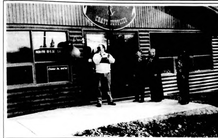
Unseasonable weather smiled upon The Grand Opening of Powerview Fabrics.

"I've made my hobby into a business." He said. "I'm not here to make a fortune, just to give the best deal possible so people don't have to drive into the city."