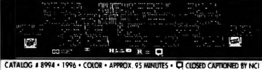
CATALOG # 8994 • 1996 • COLOR • APPROX. 95 MINUTES • CLOSED CAPTIONED BY NCI