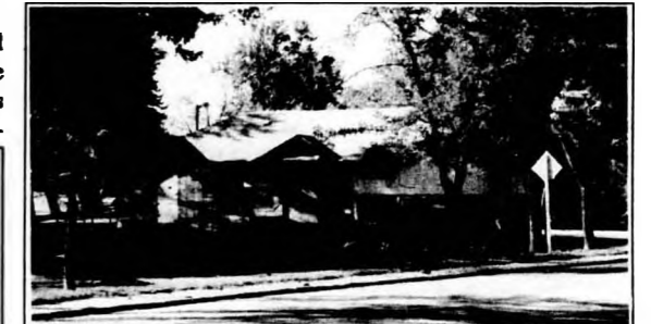
Week one: construction begins.

The Legion recently sold the Legion Hall on Oak St. to the Agassiz School Division.