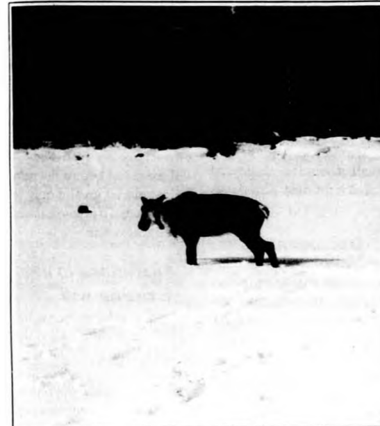
One of the caribou used in the migration study.

Around 700 students and adults took advantage of the annual Model Forest Open House at the Great Falls Community Centre on Friday, October 4. Students from as far away as Beausejour, Pinawa and Wanipigow took advantage of the open house to meet and talk with scientists and consultants engaged in Model Forest projects relating to sustainable development, and the protection of the local forest ecosystem.