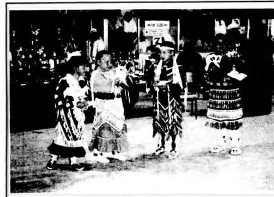
Junior Girls Jingle

Pine Falls Bowling League is holding their annual meeting on Thursday, Sept. 19th at the Legion House, 7:30 P.M. All persons interested in joining the bowling league are asked to attend. Teams can be entered at this meeting. Any suggestions or new ideas for improving the league will be discussed at this time. Be Sure To Attend!