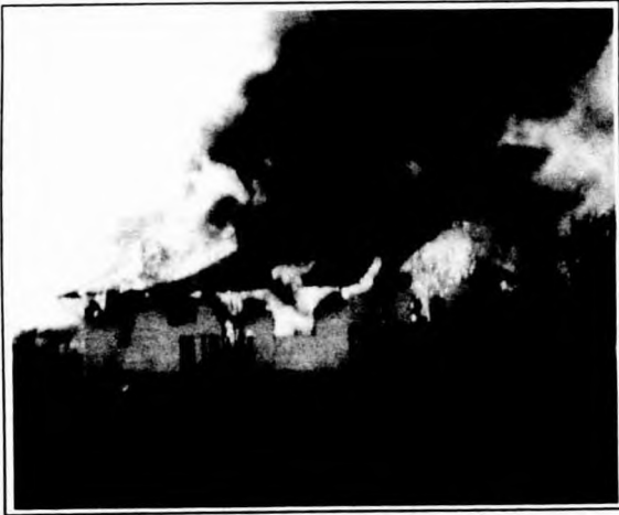
House in Sagkeeng up in flames

On the rainy evening of Sunday, August 4th 1996 a call went out to the Sagkeeng Fire Dept. dispatching them to a house fire on the north shore of Sagkeeng. The call came in at 7:28pm. and we arrived at the site three minutes later. Family members and neighbors were standing along the highway and watching helplessly as the blaze consumed their home and belongings.