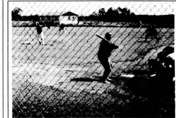
Men's Fast Ball Tournament