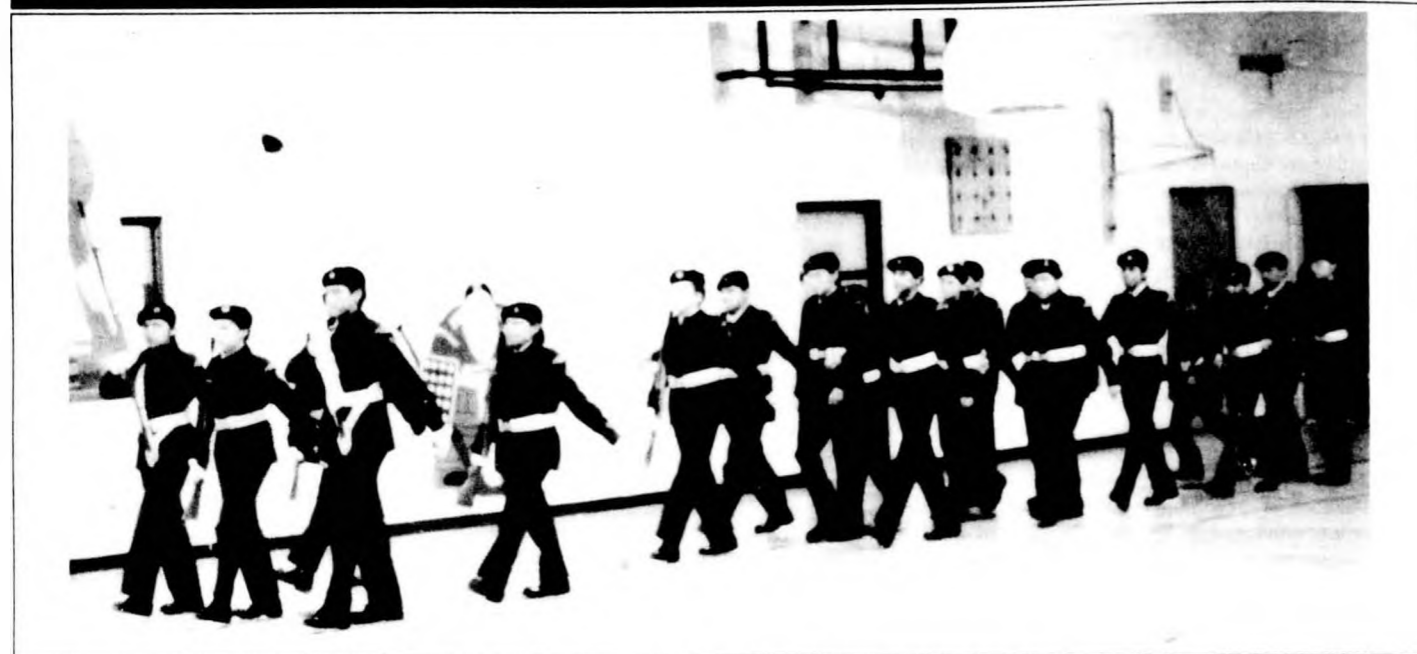
Hollow Water Cadets on parade