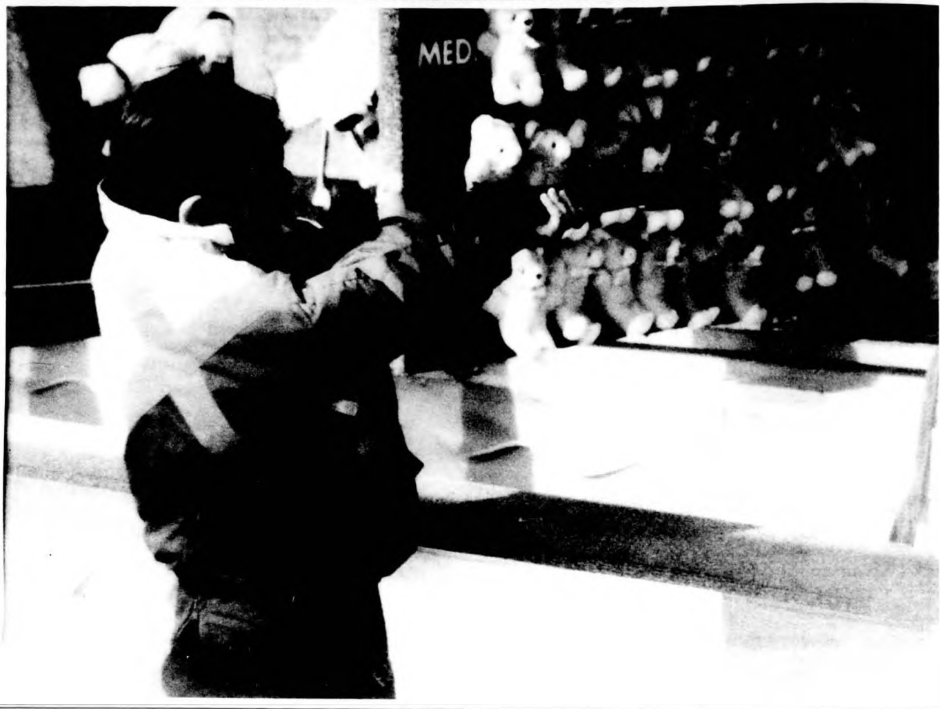
A youngster hones his skills at the shooting gallery at the Midway of the Manitoba Metis Federation Rendezvous last weekend. The festival is turning out to be one of the major festivals of the area.