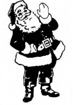
Merry Christmas & See you next year!!

MOVING - must sell furniture etc. Can be seen at apt 1-88 3rd St. South Beausejour. Reasonably priced Call 268-2849 or 268-3157 for best time to be seen.