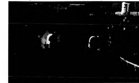
Chuckwagon Races are a daily highlight at the Manitoba Stampede located in Morris.

Folklorama One of the best-known of Manitoba's festivals is Folklorama, where 20,000 volunteers present the foods, talents and cultures of people from virtually all over the world. The