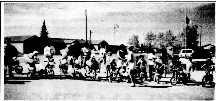
Kids gear up for the big event

It was a colourful event! On Saturday May 28th, in St. Georges, the three and four year old children from Le Petite Soleil Mini-School, participated in a bike-a-thon fundraiser. Bikes, "trikes", and even wagons were adorned with balloons, streamers, ribbons, dolls, and dinosaurs.