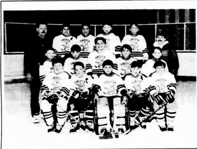
The Minor Novice Team beat Lac du Bonnet and Hazelridge in a home and away round robin series to claim the Northeastern Manitoba Hockey League Trophy, with four straight wins.