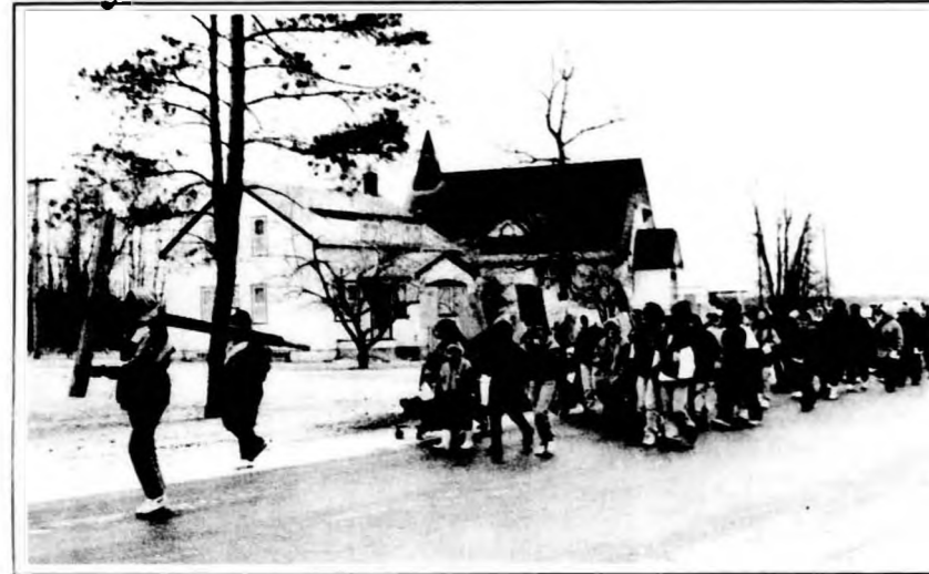
On a cold, blustery, overcast day local Catholics follow the way of the cross from St. Teresita to Notre Dame du Laus in the traditional in the traditional Good Friday pilgrimage