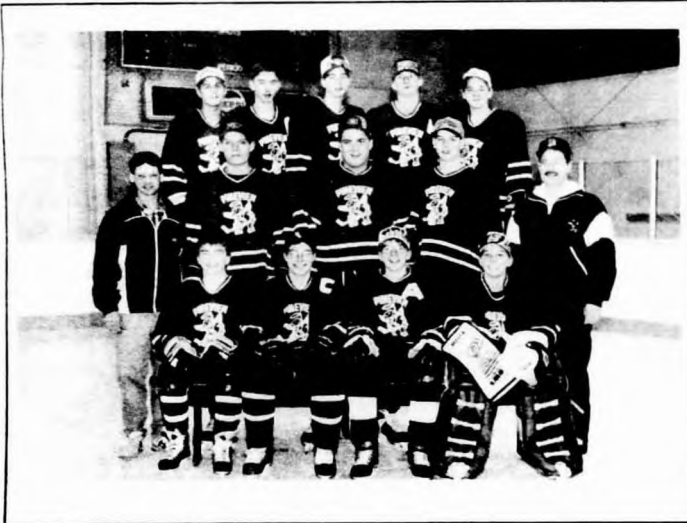
Bantam C Team won two straight games over Niverville to win the championship trophy. They also won a silver medal at the Carman, Manitoba Provincial A playoff tournament.