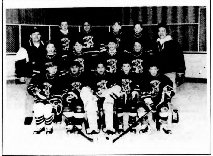
The Minor Atoms won two straight games in their final series with Lac du Bonnet to claim this year's championship