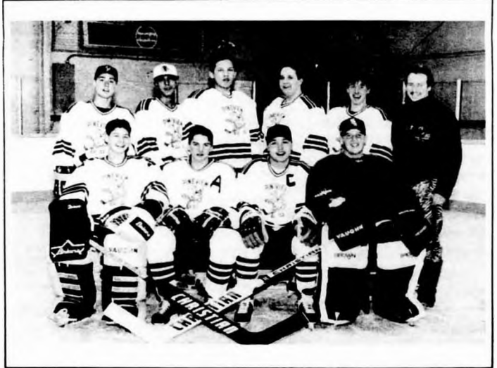
The Bantam B Team won a hard fought series two games to one to claim the Carrilon League Trophy