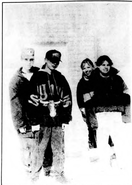
Students at Walter Whyte School enjoying festival competitions