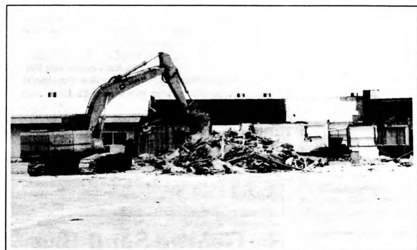
Wrecking Crew tears down the old Pedden's Restaurant