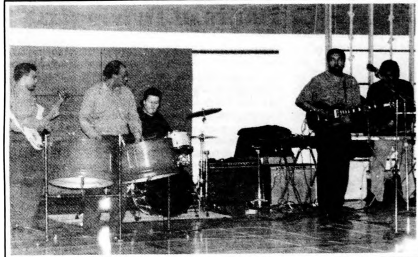
Calypso band "The Vibrations" played the Powerview School Gym last Friday.