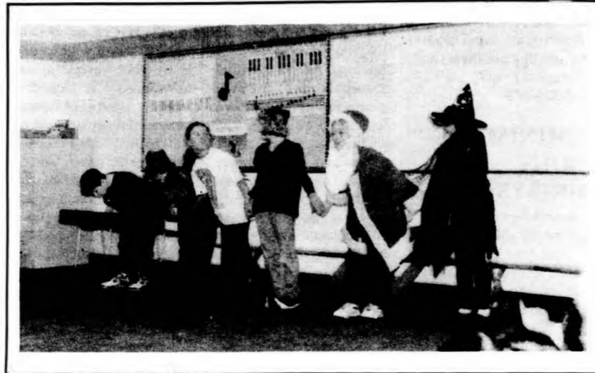
Children at Powerview School