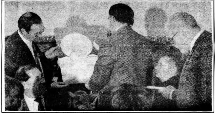
Russian accepting presentation from Model Forest Delegation.

The Manitoba Model Forest played host to a delegation of senior foresters and forest researchers from Russia on December 16.