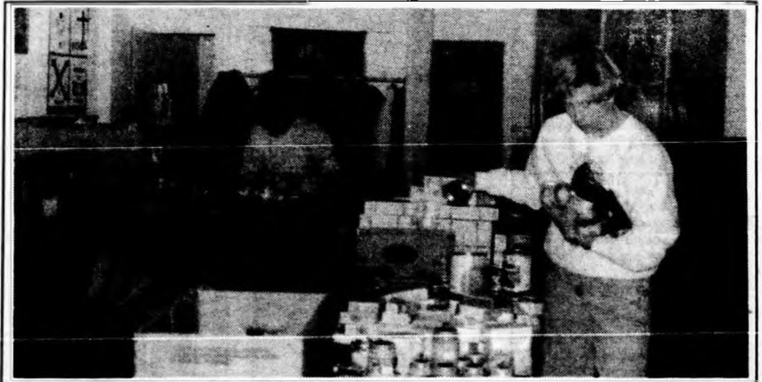
Christmas hamper workers at Pine Falls Catholic Church - see story page 6