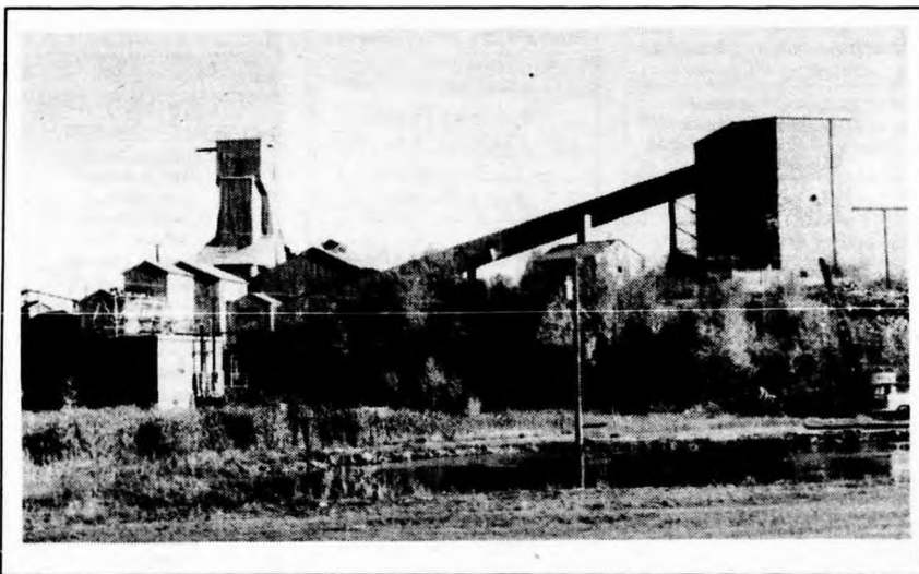
San Antonio Gold Mine at Bissett. De-watering should begin today (Wednesday)

The mine now employs 14 people and will increase to about 40 within a few months, it will peak in about eight months when production begins and construction of the expansion is underway. Employment will level off at about 180 when the mine is in full production.