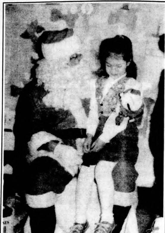
Walter Whyte Students got an opportunity to ask Santa for that Special Christmas present

It was a wonderful time for all. Breakfast for the approximately two hundred in attendance, was pancakes and sausages, juice and coffee for the parents, grandparents, aunts and uncles. (A wonderful lady in attendance looked