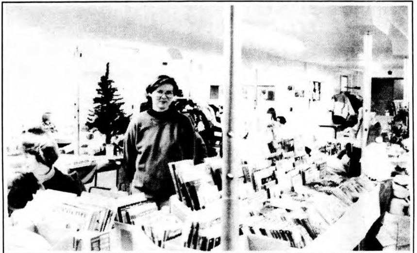
Book counter at St. Georges Bazaar