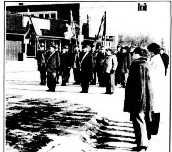
Memorial Day Parade - Royal Canadian Legion & RCMP at the Pine Falls Cenotaph