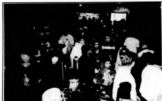
Ka-Wawiyak Kid's Halloween Bash '93