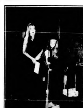
Best Witch or Warlock Costumes