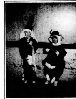
Most Original Costumes