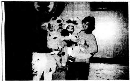
Cutest Baby Costumes

A big Thank You to the following people, businesses and organizations for your help and donations towards the Kid's Halloween Bash that was held on October 24th. Thanks to you it was a great success