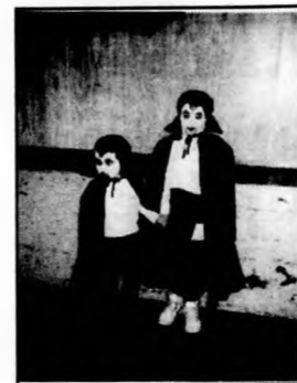
Best Group Costumes