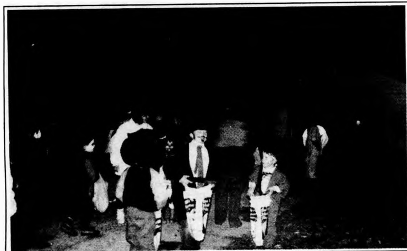
Apprehensive costumed kids approach the Wilson's Spooky Garage