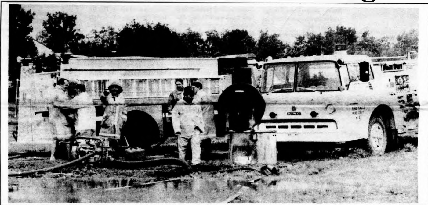
Role reversal for firefighters - pumping water out of, not into houses.